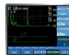
Weld Graph Illustration